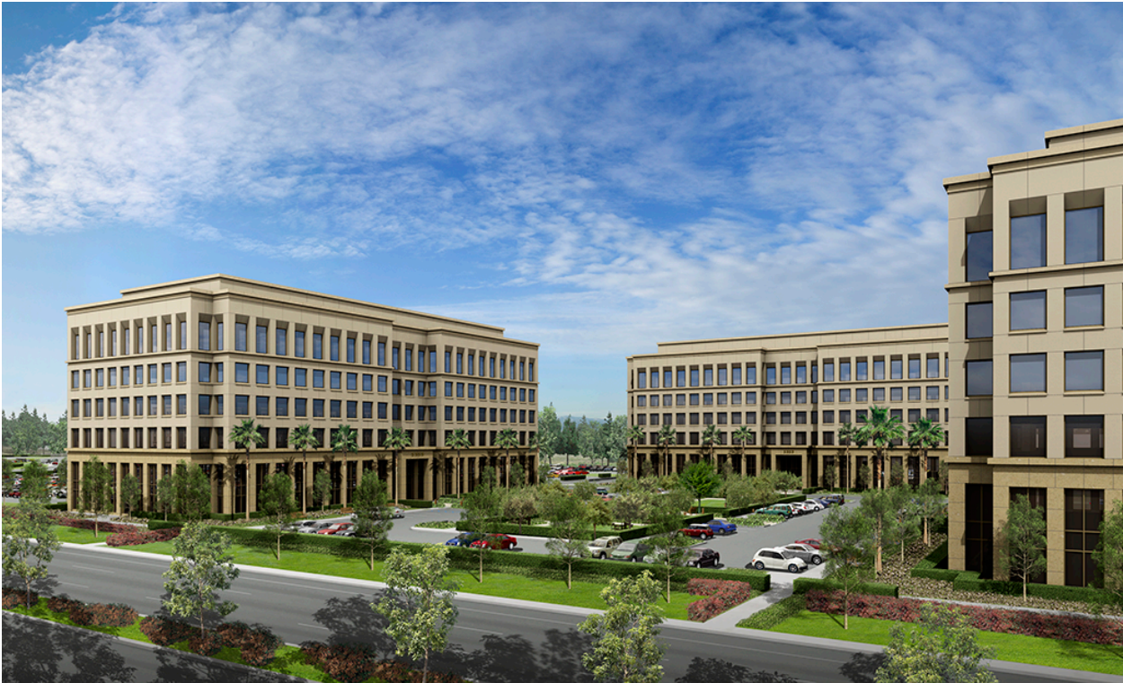
Santa Clara Gateway Irvine CA