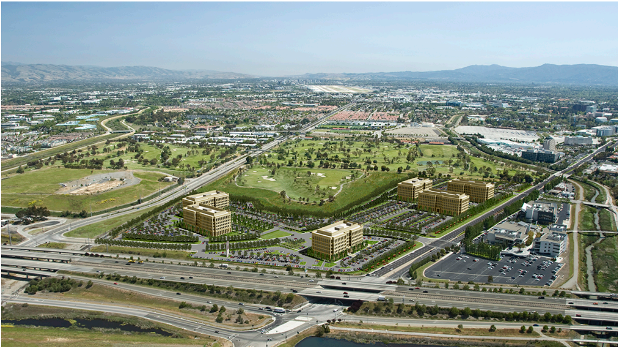
Santa Clara Gateway Irvine CA