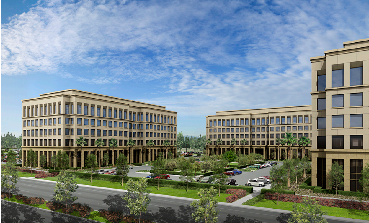
Santa Clara Gateway Irvine CA