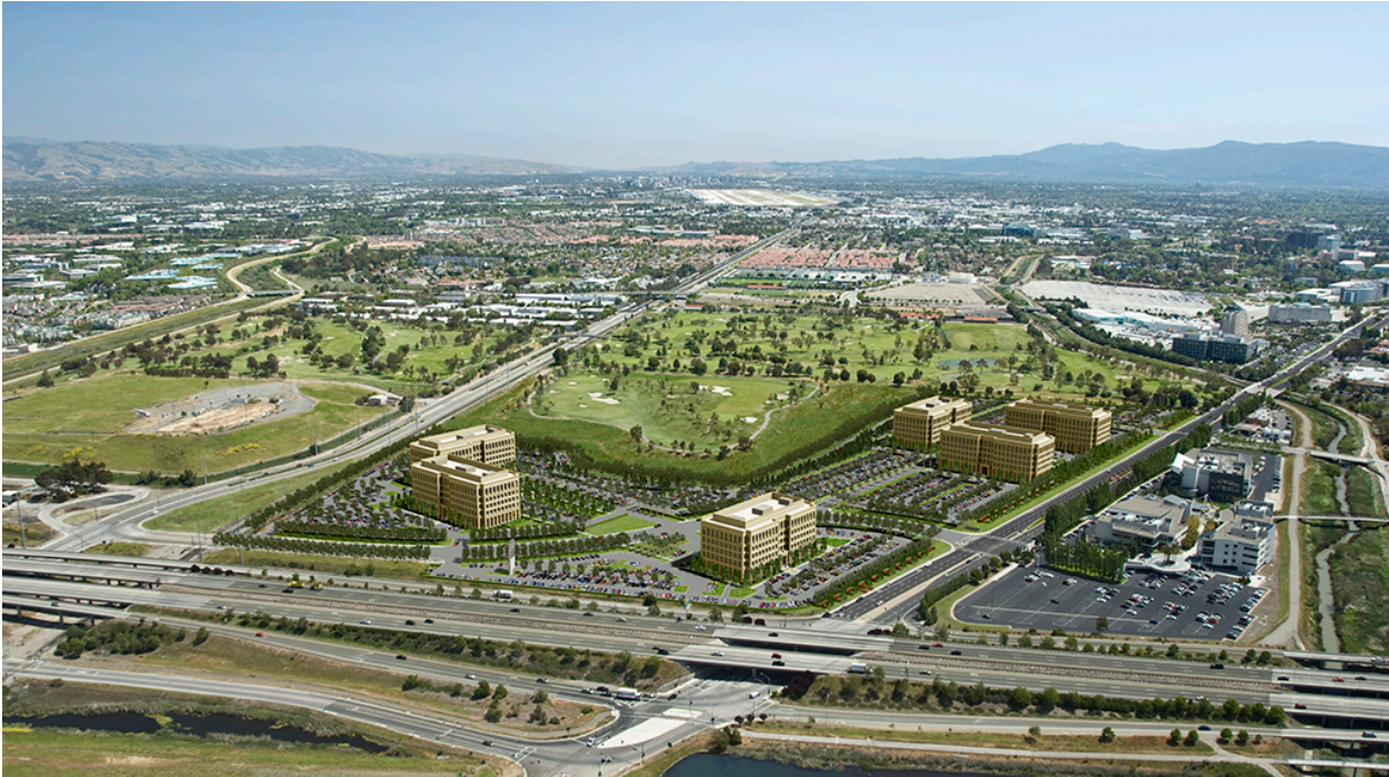
Santa Clara Gateway Irvine CA