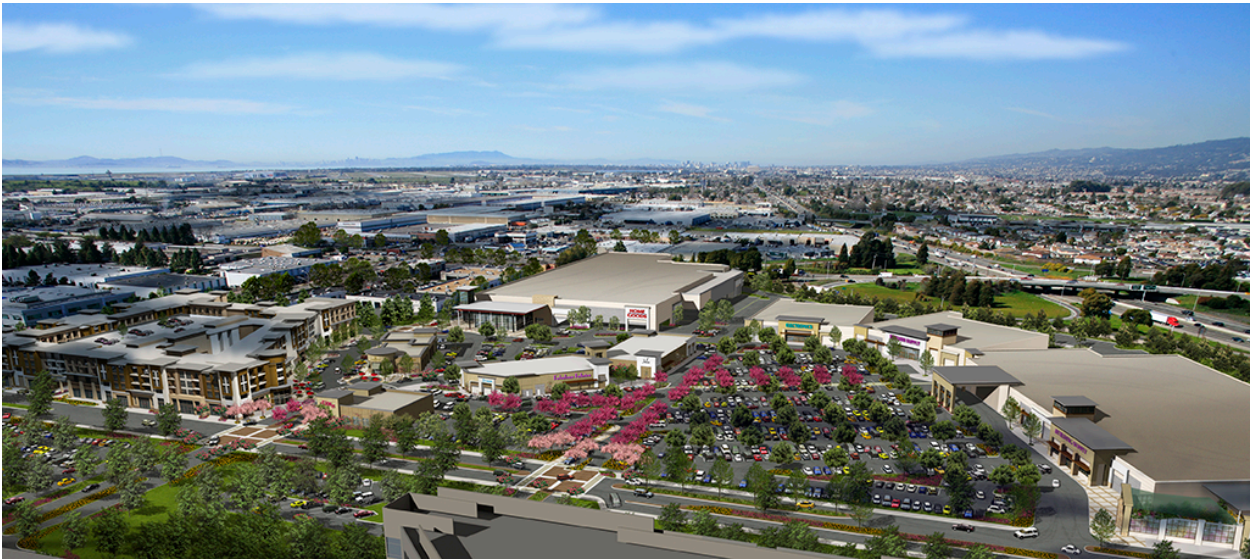
San Leandro, Pleasant Hill CA